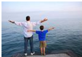
What we see